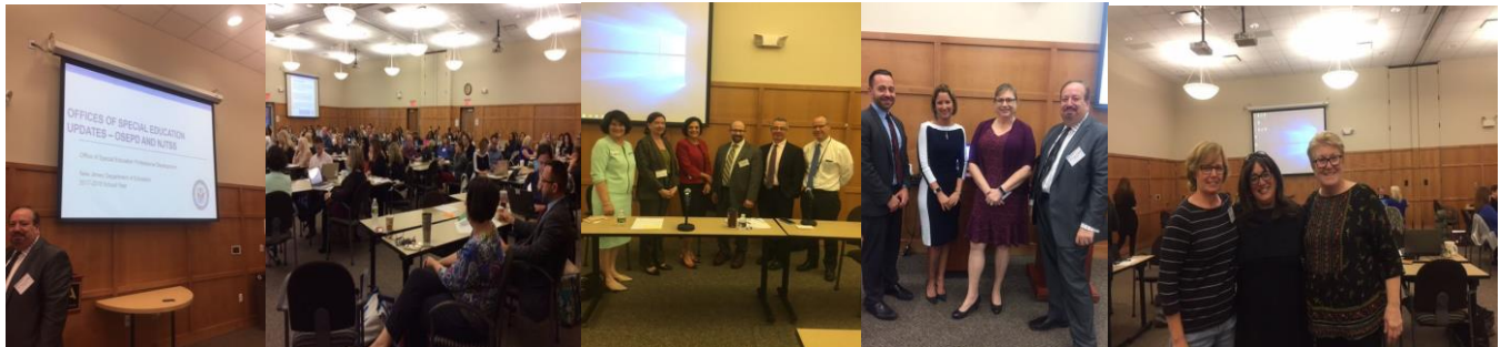
OSEPD and NJTSS Updates