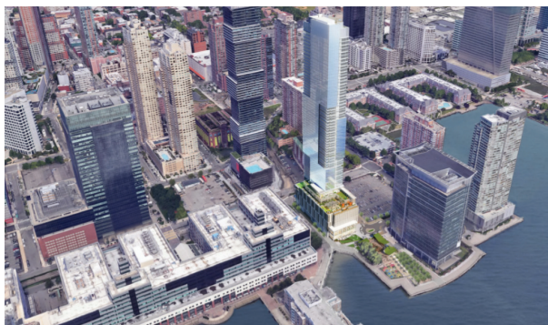
A digital rendering by Elkus Manfredi Architects of Mack-Cali Realty Corp.'s Harborside project in Jersey City.

Developers and REITs continue to choose us because of our reputation, experience and proven abilities to handle complex real estate projects. We pride ourselves and distinguish our practice by integrating our legal skills with the business model of the project, the community and political facets that may be in play, and the regulatory environment that will drive the permits and approvals process. This integrated approach has given us the opportunity to assist our clients develop tens of millions of square feet of industrial space and tens of thousands of residential units.